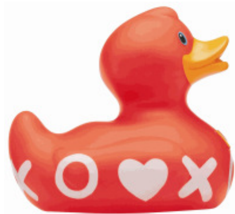
BAdrg040SS Designrom Rubber duck (Hugs & Kisses)