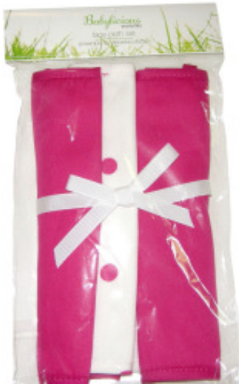
BAbab020B Babylicious Washcloth (Bloom) 3 pack

BATH- wash cloths Price - $12.00 SALE $9.00