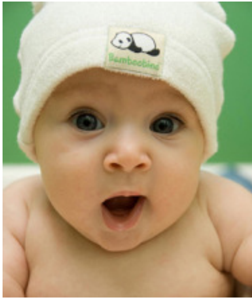
BAbam030LG Price - $16.00 Bamboobino organic after bath hat (0-6 months or 6-12 months)