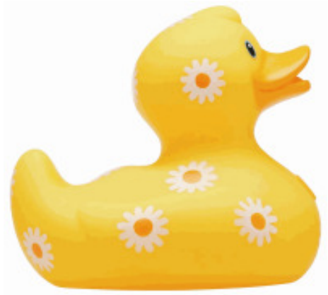
BAdrg040DY Designroom Rubber duck (Daisy)