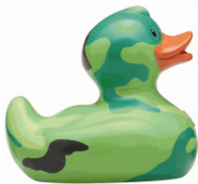
BAdrg040T Designroom Rubber duck (Trooper)