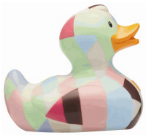
BAdrg040FA Designroom Rubber duck (Fashion)