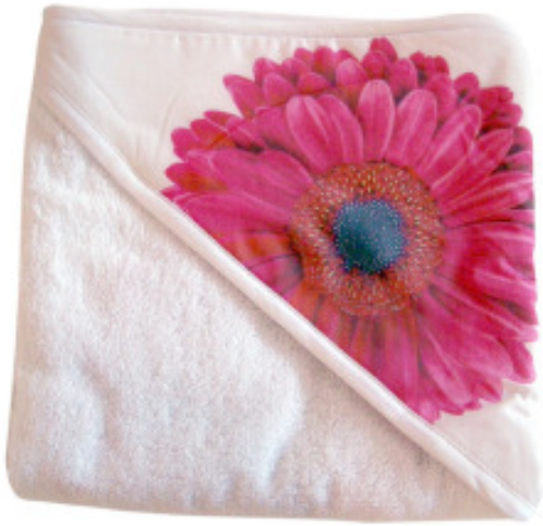
BAbab010B Babylicious Hooded Towel (Bloom)

BATH- hooded towels Price - $34.00 SALE $25.00