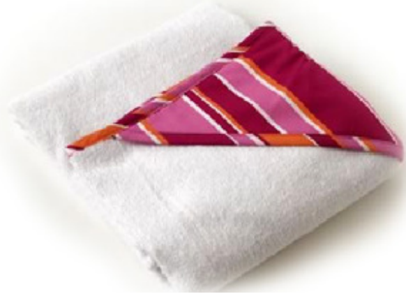
BAbab010PS Babylicious Hooded Towel (Posie Stripes)