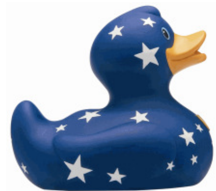
BAdrg040SS Designrom Rubber duck (Super Star)