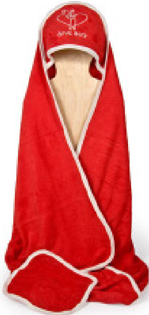
BAkee010LB Kee-Ka Hooded Towels (LoveBug)