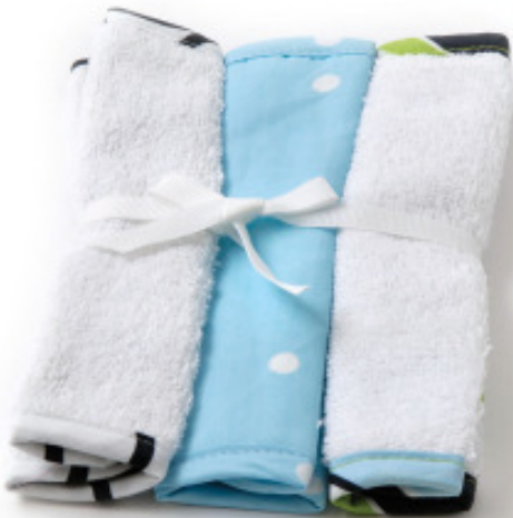
BAbab020I Babylicious Washcloth (Island) 3 pack