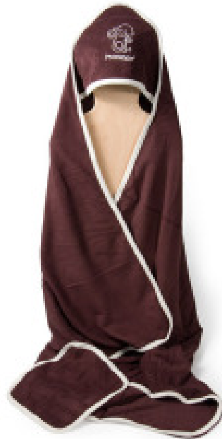
BAkee010M Kee-Ka Hooded Towels (Monkey) OUT OF STOCK