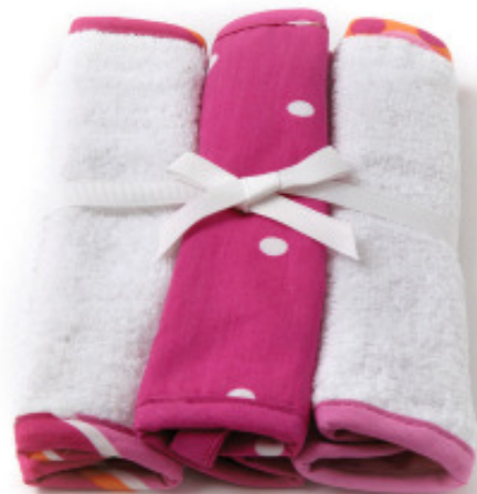
BAbab020P Babylicious Washcloth (Posie) 3 pack