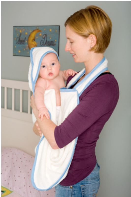
BAbam032BL Price - $46.00 Bamboobino organic bath apron (Blue, Pink or Brown Trim)

www.connectmommies.com T: 403.828.5554 Email: mom@connectmommies.com