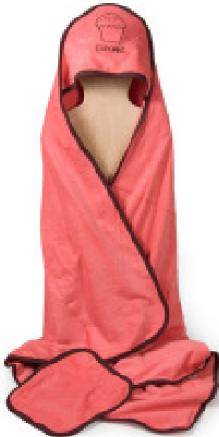
BAkee010C Kee-Ka Hooded Towels (Cupcake)