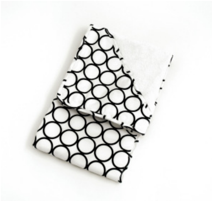
BAbab010IH Babylicious Hooded Towel (Island Hollow)