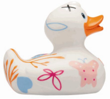
BAdrg040DD Designroom Rubber duck (Daydream)