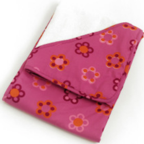
BAbab010PF Babylicious Hooded Towel (Posie Flower)

BATH- hooded towels Price - $34.00 SALE $25.00