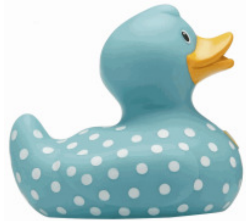
BAdrg040DL Designrom Rubber duck (Darling)