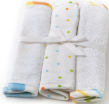
BAbab020H Babylicious Washcloth (Happy) 3 pack