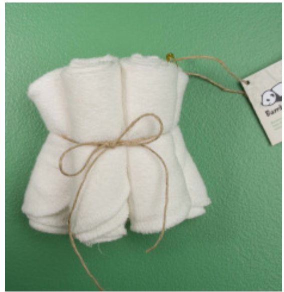
BAbam030WC Price - $14.00 Bamboobino organic washcloth (5 pk)