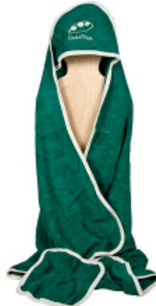
BAkee010SP Kee-Ka Hooded Towels (Sweet Pea)