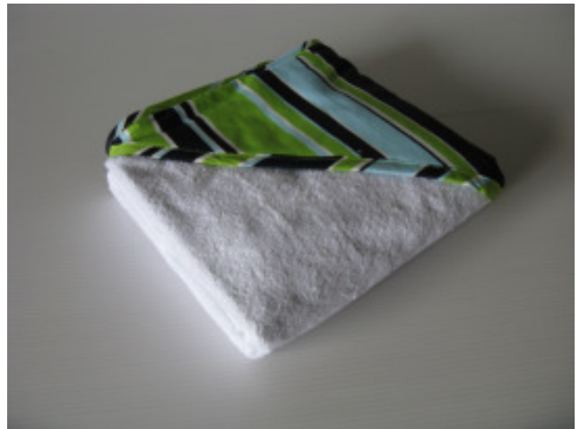
BAbab010IS Babylicious Hooded Towel (Island Stripes)