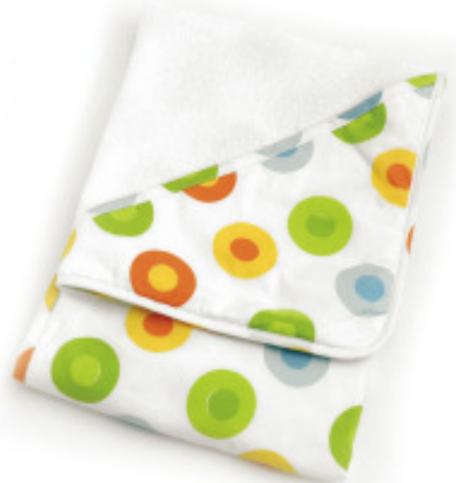
BAbab010H Babylicious Hooded Towel (Happy)